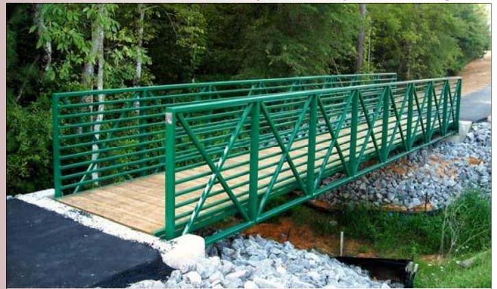
▼ 6' x 40' Expedition Style, Leesburg, AL

Pioneer Bridges are perfect for hiking/biking trails, golf courses, highway overpasses, industrial conveyor/pipe supports and vehicular bridges (one or two lane). From small garden bridges in your backyard and private driveway bridges to long clear span pedestrian bridges spanning wetlands and heavy highway loadings required by the construction industry, Pioneer has the right bridge for any project. Let us bridge your gap with a bridge that will be the perfect fit for you project.