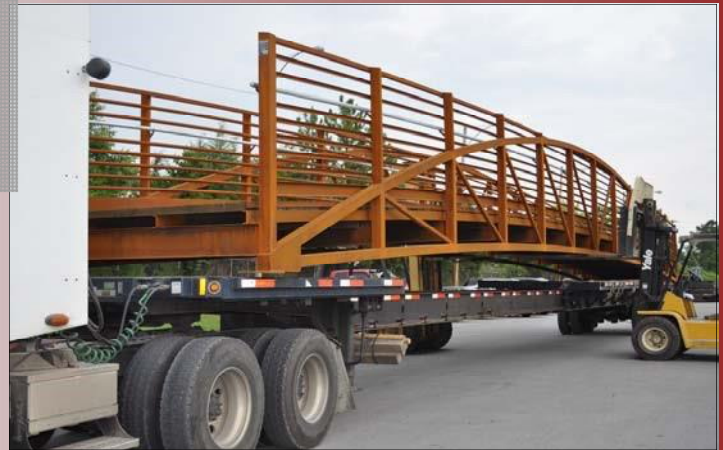
Loading of a Crossbow Style bridge with two forklifts ►

Delivery: Pioneer Bridges offers nationwide shipping of our prefabricated steel truss bridges. Your bridge will be delivered to the nearest location that is easily accessible to over-the-road trucks. We can ship a bridge up to 14' x 80' in one piece. Larger bridges are spliced for easier shipment.