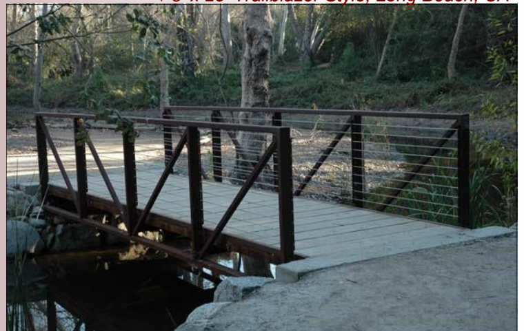
▼ 6' x 25' Trailblazer Style, Long Beach, CA

Pioneer Bridges are available in several different truss styles and can be fabricated with multiple finish and floor options. Whether you want an elegant bow truss style or the classic Pratt truss, Pioneer can provide them all. You can choose from virtually "maintenance free" weathering steel or from a wide variety of paint colors. Decking options range from pressure treated pine and Ipe hardwood to concrete or steel grating. Safety rails can be made from steel, wood or even steel cables (as shown in the picture to the right).